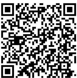
PTO Membership Form

Visit: www.fbschool.org/pto or scan the QR codes E-mail: pto@fbschool.org