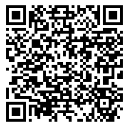
Dress Down Day Form